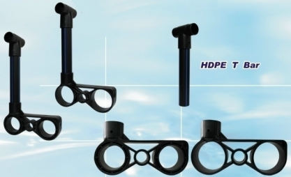
HDPE T Bar